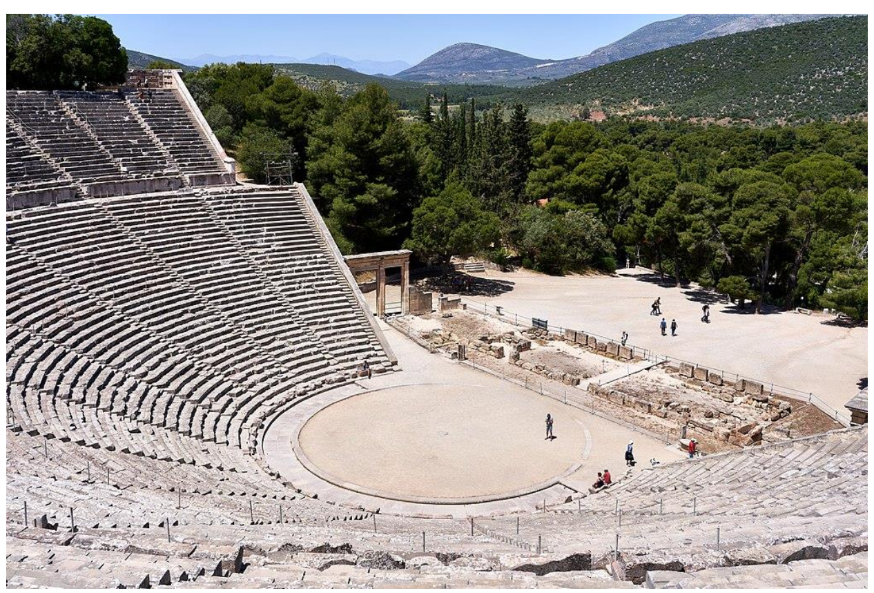
Theatre of Epidaurus

Actor's voices were naturally amplified up a hill, so audiences could easily hear performers in the plays. In fact, surviving Greek amphitheaters from the 5th and 4th centuries BC, like the Theatre of Epidaurus below, are acoustically near-perfect.